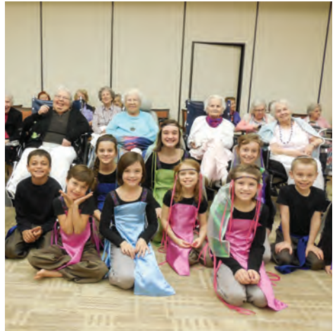
Members of the Israeli folk dance group Yom Simcha take a break.

Another event on the 7th day, Yom Sim-cha , a local Israeli folk dancing group of children ages 7-16, delighted residents with traditional Israeli music and dancing while wearing colorful costumes. Energy filled the room as the children danced and the residents clapped their hands in excitement. It was a truly magical event!