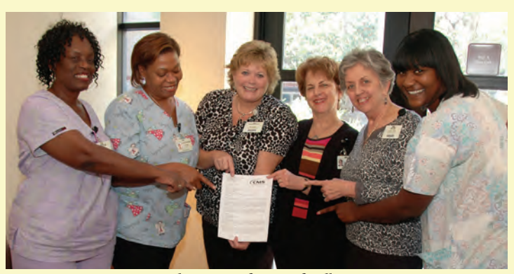
Our Medicare certification finally arrives!

In addition to the Medicare skilled services, our Home Health Care agency continues to offer nursing case management / medicine management and home health aide services for private pay to people living in their own homes. A client's daughter recently commented