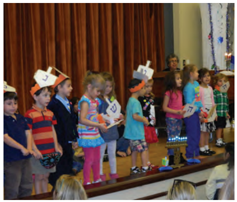
DuBow preschoolers perform Chanukah songs for residents.