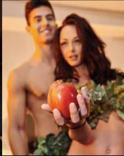
*"Adam and Eve"