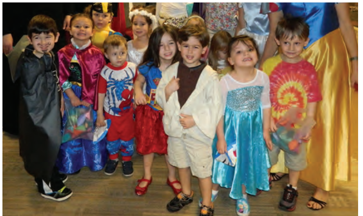
DuBow preschoolers from The Jacksonville Jewish Center get ready to parade through the halls during a Purim celebration