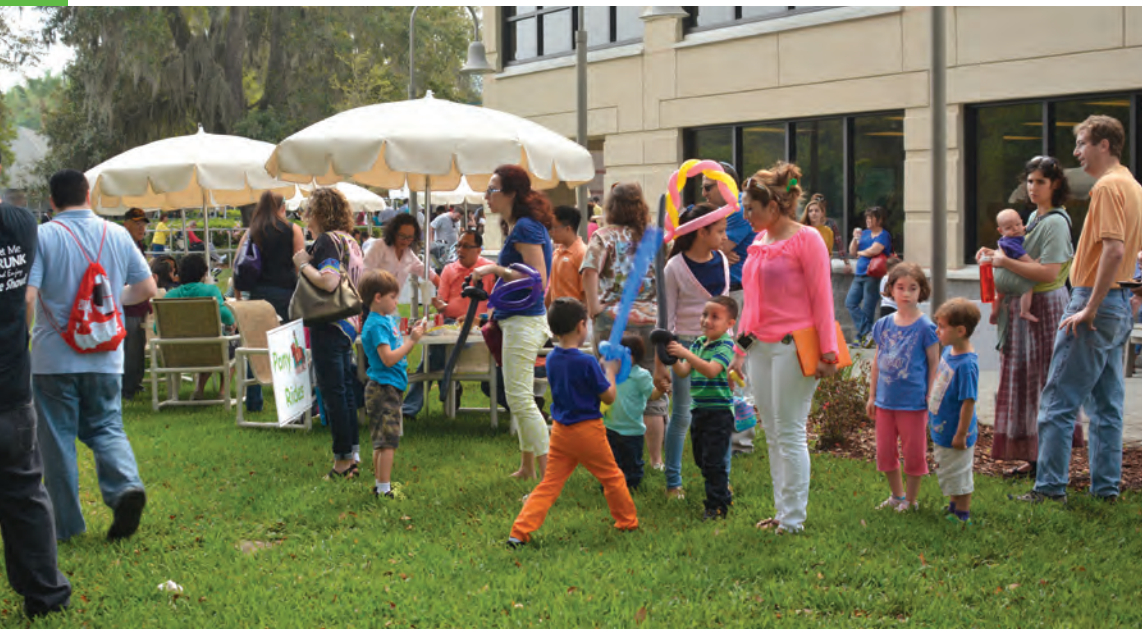
Guests of all ages enjoyed a wonderful Anniversary Day afternoon.