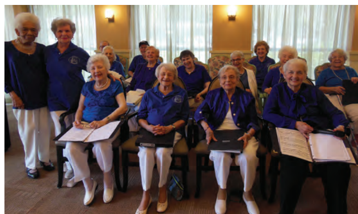
The Coves Choraleers take five during rehearsal.