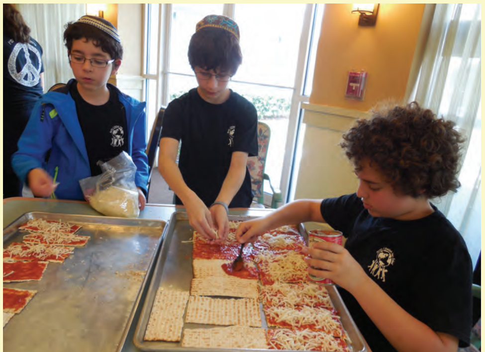
6th grade students prepare matzah pizza.

Before the tasting began, we shared favorite memories of seders past, and the nostalgia was an enjoyable experience. We thoroughly enjoy our activities with the students and have developed a terrific relationship with them.