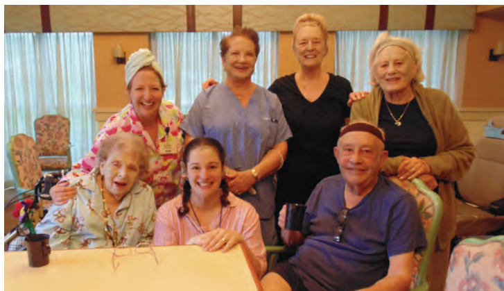
Having fun at the pajama party!