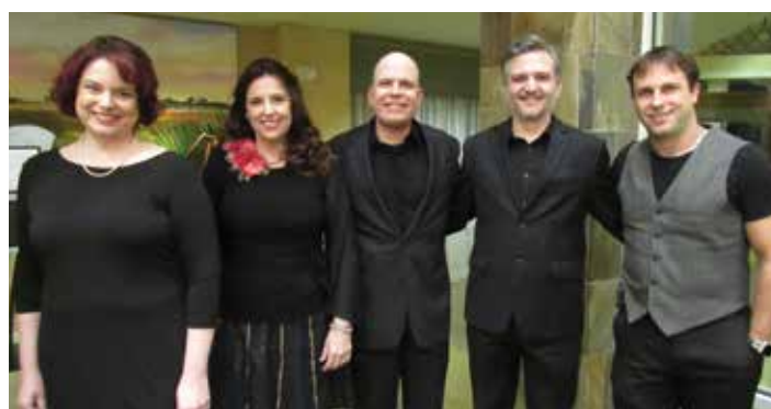
Members of Bella Voce, the evening's outstanding Soprano and Tenor entertainment