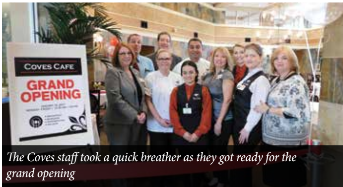
The Coves staff took a quick breather as they got ready for the grand opening