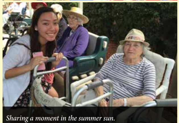
Sharing a moment in the summer sun.