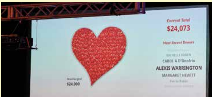
The first ever live ask at the Gala raised more than $25,000. Thank you to Ackerman Cancer Center for matching the first $7,000 to get a great start.