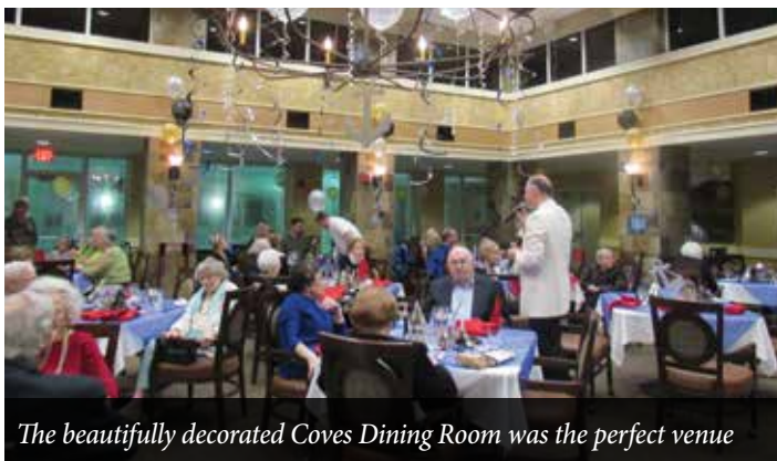
The beautifully decorated Coves Dining Room was the perfect venue