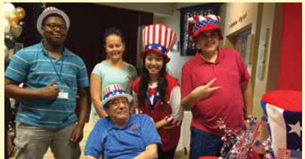
Americana was the theme for the Mad Hatter Tea Party and teens were in full regalia.