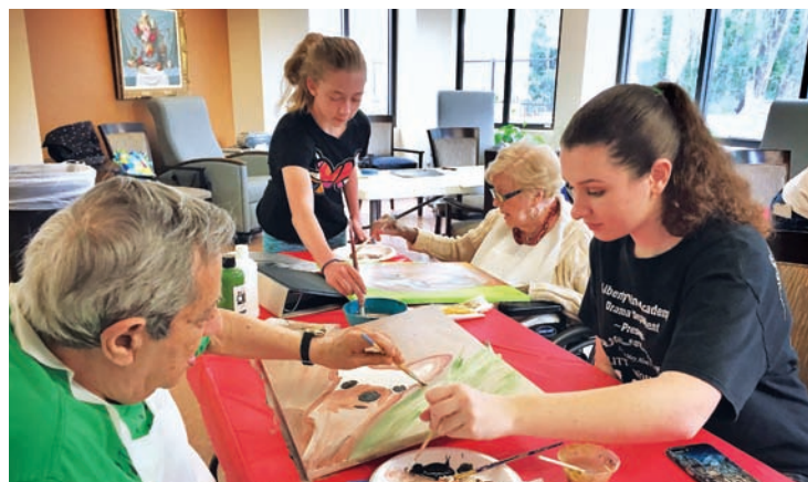
With each stroke of the brush, favorite pets' personalities come to life.

Due to the program’s success, River Garden will receive a Jewish Programming award at the Association of Jewish Aging Services (AJAS) conference in February.