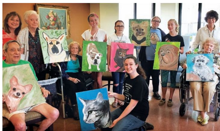
Teens, residents and volunteers proudly display their completed canvases.