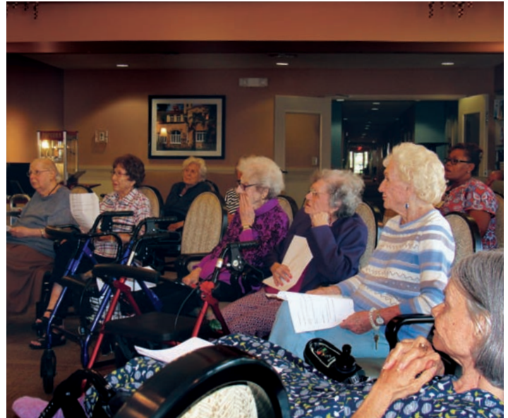
Program attendees pay close attention during a recent presentation.

We recently developed and implemented a series of health classes for Coves members. We decided to focus on wellness, instead of the typical focus on illnesses or diagnoses.