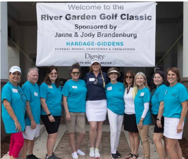
Special thanks to our amazing volunteers!