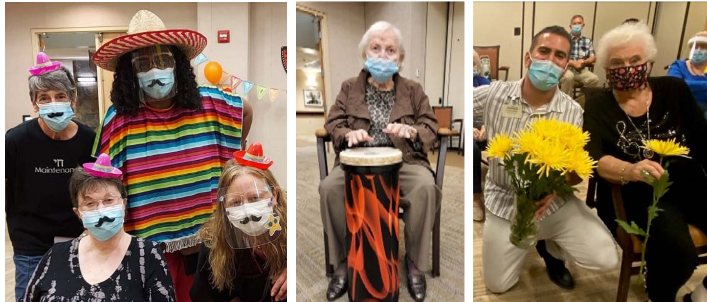
Residents, volunteers and staff get moving while feeling festive at the Fiesta Party, Drum Circle and Seated Latin Dance class.