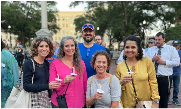
River Garden staff and family attend the community vigil against antisemitism at the James Weldon Park downtown Jacksonville.

We are committed to working together with our partners and friends to build a community guided by values of mutual respect and understanding.