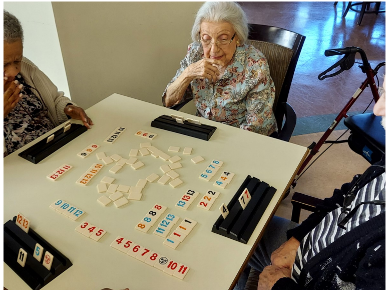
A nationally recognized leader in senior care, River Garden's Adult Day Program offers stimulating activities and encourages group interaction.

For more information about the program, please contact Erica Hickey at (904) 288-7858 or ehickey@rivergarden.org .